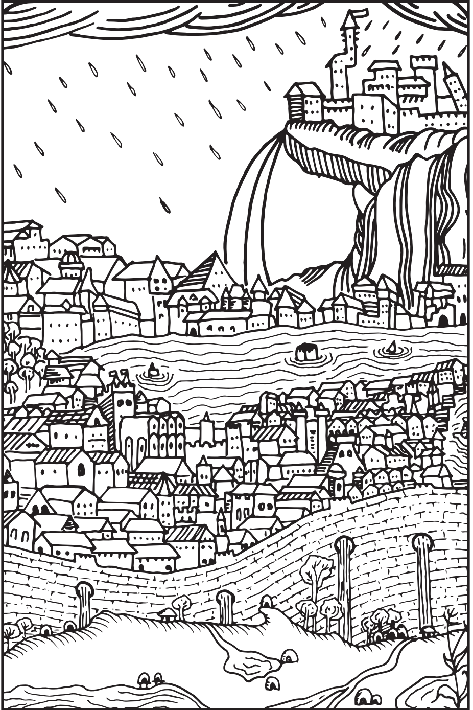
The Rainy City, looking north from Pondheim in the Sump